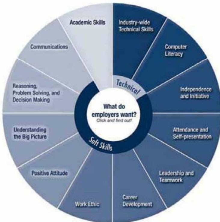
Figure 3: Illinois workNet Skills Wheel

What approach is Illinois workNet taking? Illinois workNet, the state's primary online workforce development Web site and resource for Workforce Investment Act (WIA) services, is addressing the need for credentials not by focusing on any one assessment, but by working with partners to implement a customer service approach that integrates a set of assessments throughout a continuum of services. This set of available assessments includes skill and interest profiles, pre-assessments, work-readiness activities, and work-readiness assessments that include observational notes by instructors and employers. The outcome focus is a promise, to customers and employers, to meet employment needs. The first step in addressing this need was convening a workgroup in partnership with Chicago Workforce Investment Council, Illinois Workforce Professionals programmatic committee members, and other LWIA directors. The focus of the group is to identify outcomes benefiting workers and employers.